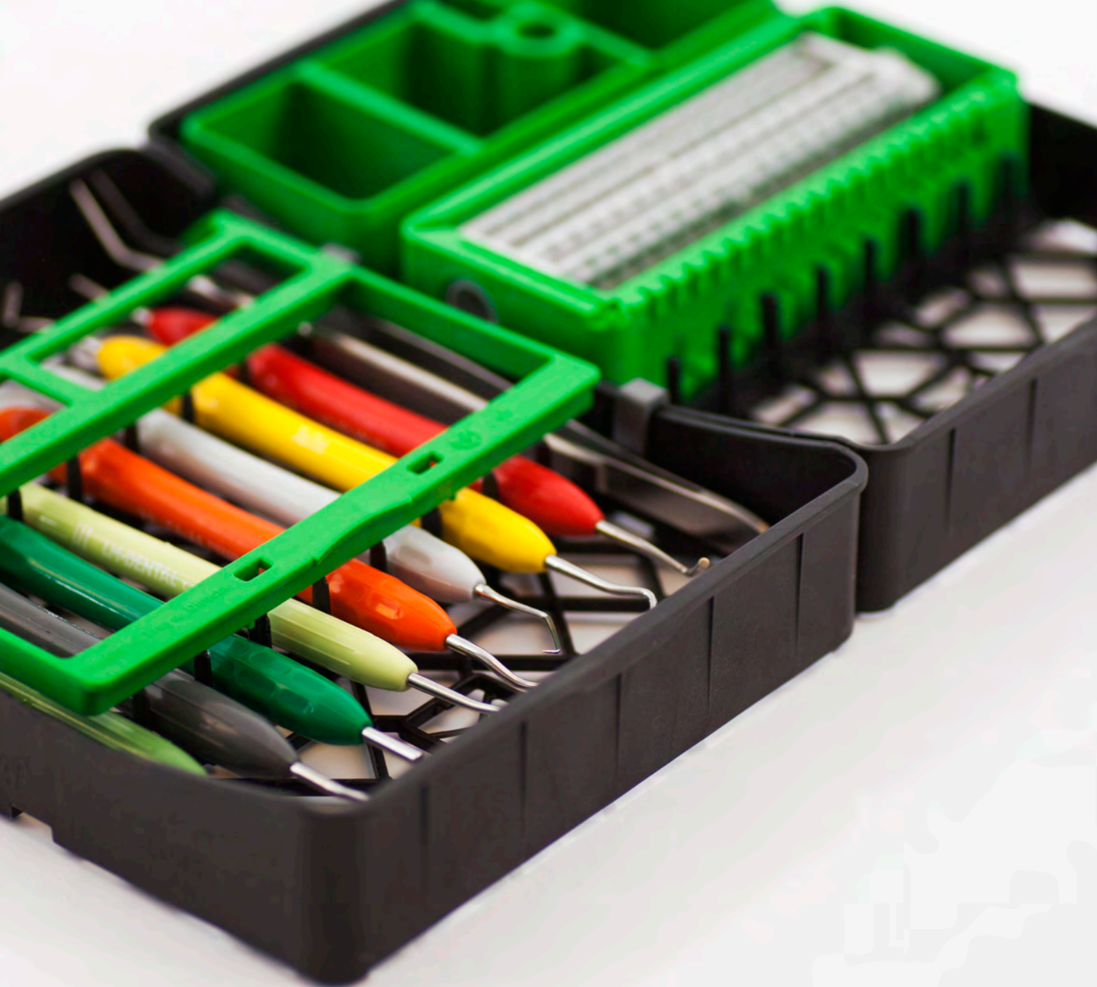
PractiPal® Full Tray