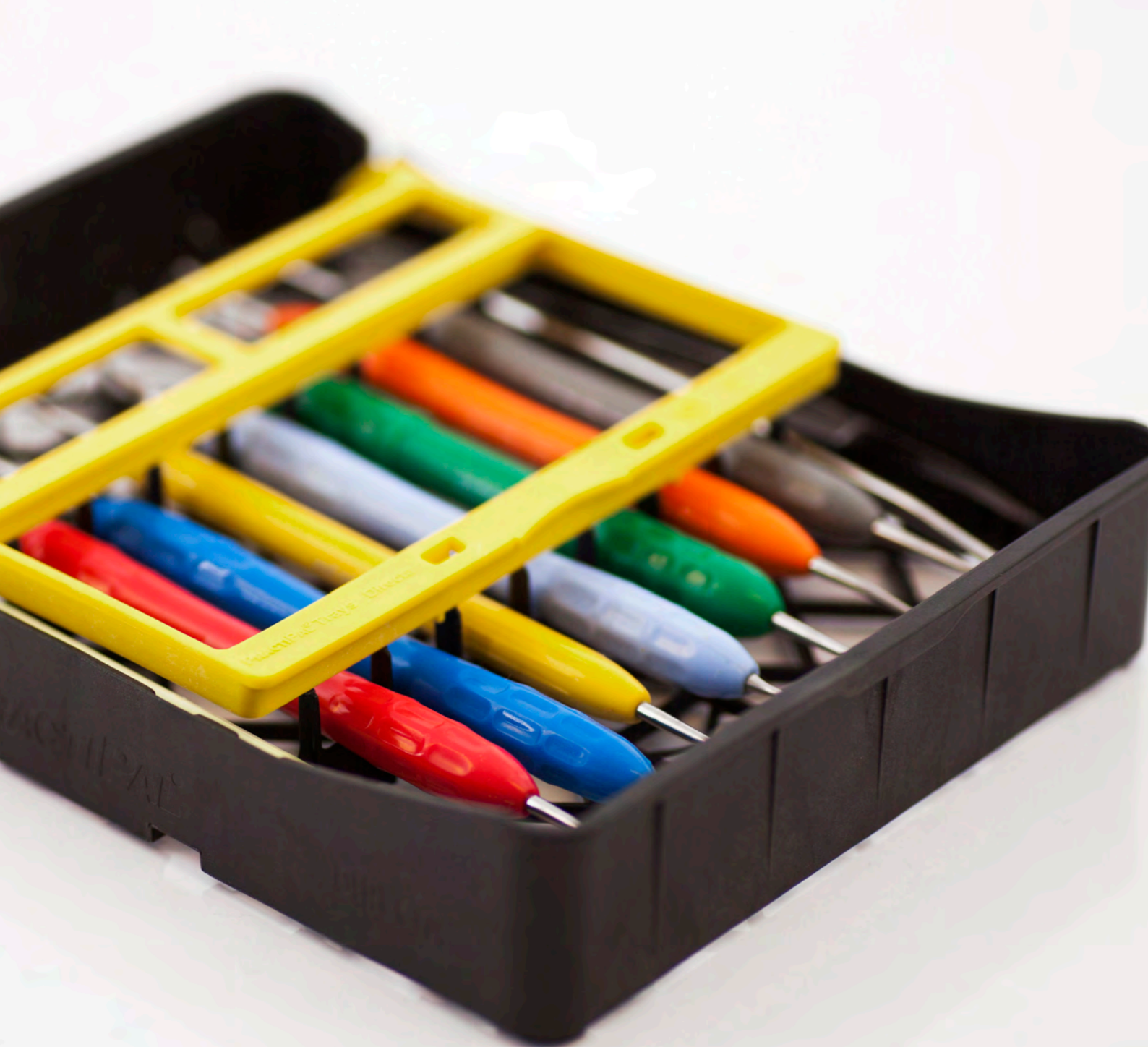
PractiPal® Half Tray