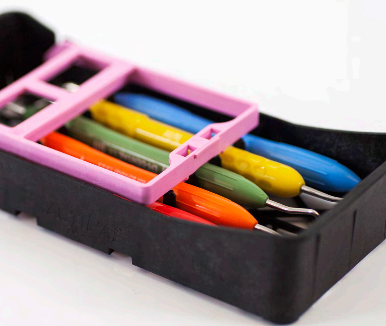
PractiPal® Mini Tray